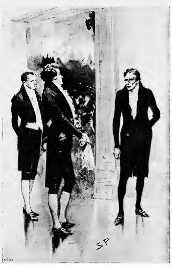
"LOST LIKE THE DEUCE," HE SNAPPED.